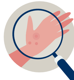
Dermatology (skin care)