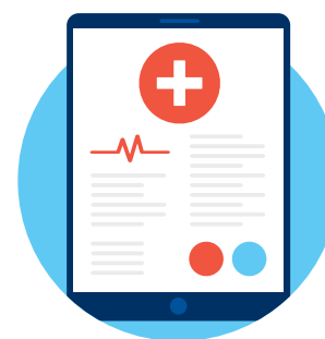
Remote monitoring services

to address conditions such as sinusitis, back pain, urinary tract infections, common rashes, etc.