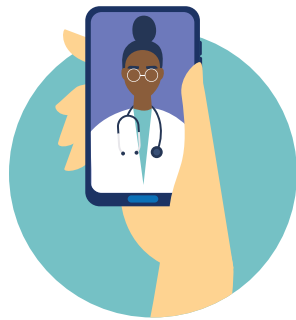
General health care, like wellness visits

Your doctor will decide whether telehealth is appropriate for your health needs. For example, you may be able to get: