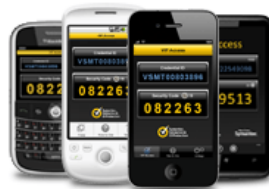
❖ Get VIP Access for Mobile

Get Validation & ID Protection (VIP) to help protect your online accounts and transactions. The VIP credential provides a dynamic security code that you can use in addition to your user name and password for safe and secure account access.