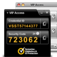
❖ Get VIP Access Desktop