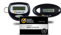
❖ Get a VIP Security Credential