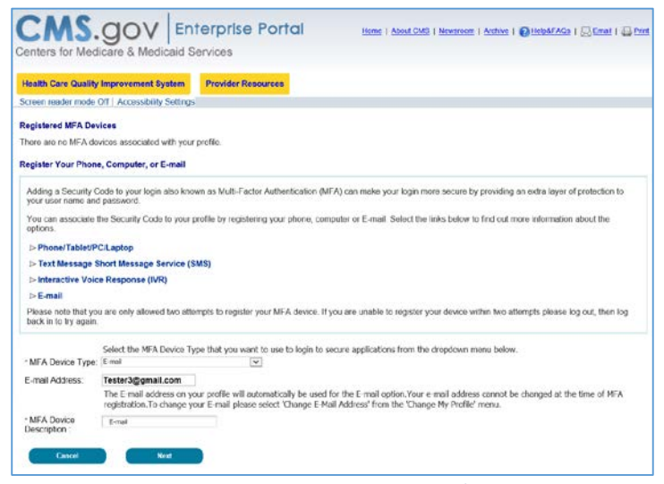
Figure 4: MFA Option B - E-mail

Note: The E-mail address cannot be changed at the time of MFA device registration. It can only be changed using the 'Change E-Mail Address' option from the 'Change My Profile' menu.