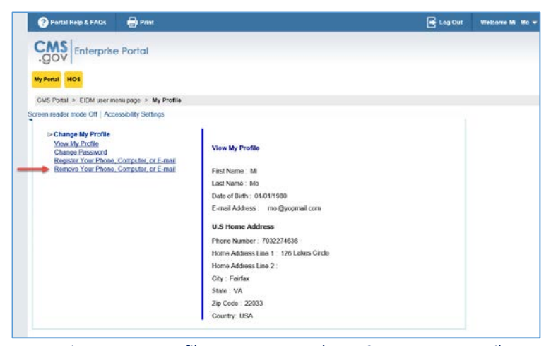
Figure 14: My Profile - Remove Your Phone, Computer, or E-mail