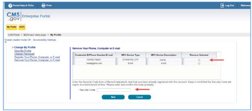
Figure 15: Enter Security Code to Remove Your Phone, Computer, or E-mail