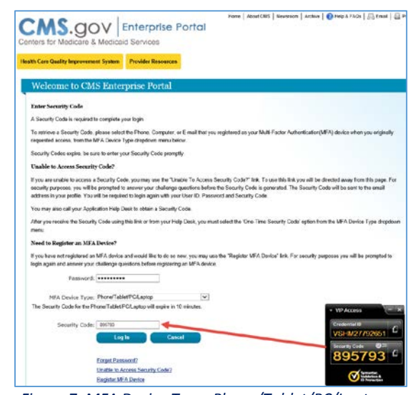
Figure 7: MFA Device Type: Phone/Tablet/PC/Laptop