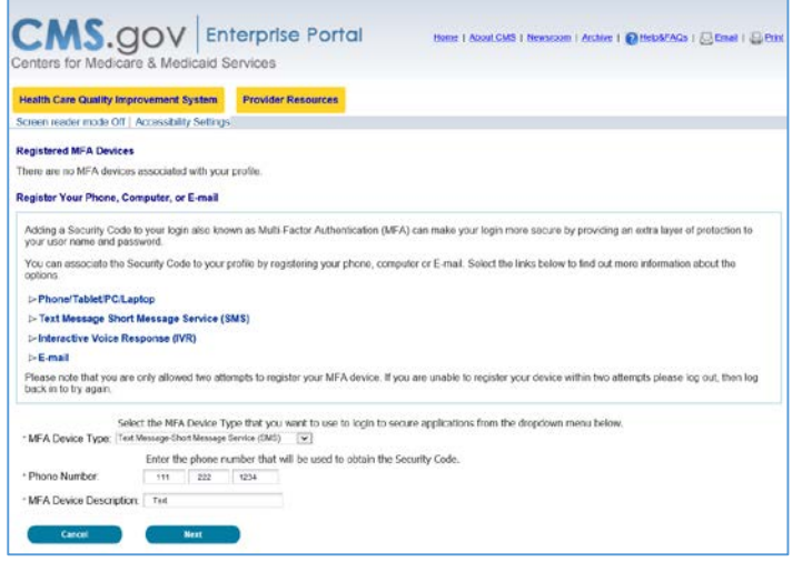
Figure 3: MFA Option A - Text Message - Short Message Service (SMS)

A) If selecting Text Message – Short Message Service (SMS) as the MFA Device Type, enter the Phone Number that will be used to obtain the Security Code. Enter a brief description (e.g., Text) in the field labeled MFA Device Description and select Next.