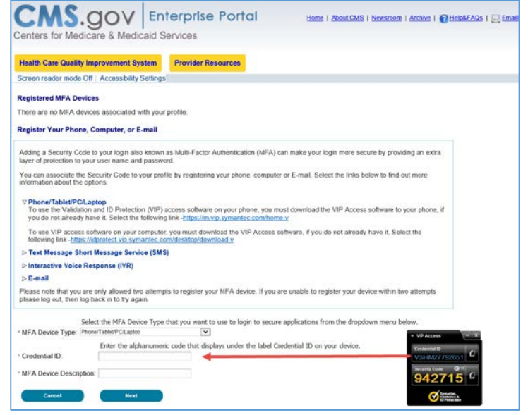
Figure 5: MFA Option C - Phone/Tablet/PC/Laptop and VIP Access Software

Note: Extension is an optional field. You may choose to provide a 10-digit phone number or a phone number with an extension.