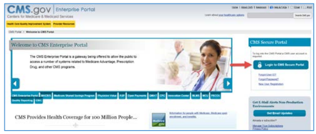
Figure 1: CMS Enterprise Portal Home Page

Note: If you register prior to June 19 you'll need to navigate to the CMS Portal "My Profile" page to register an MFA device.