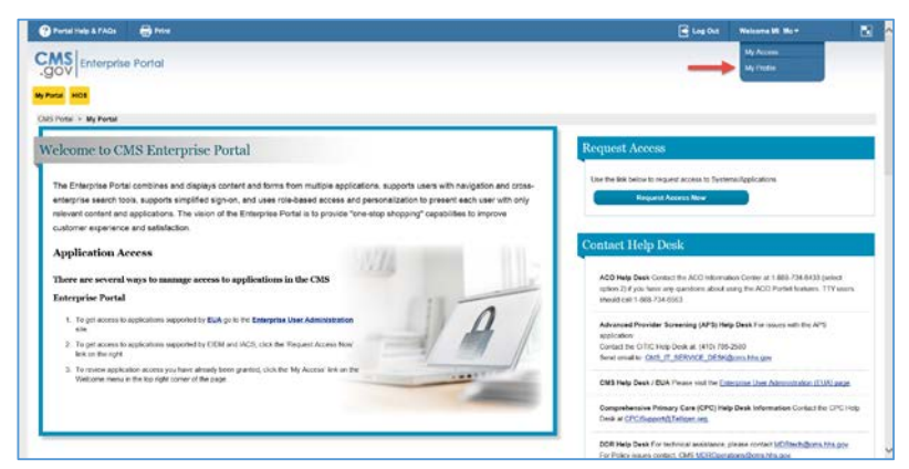
Figure 13: CMS Enterprise Portal - My Profile