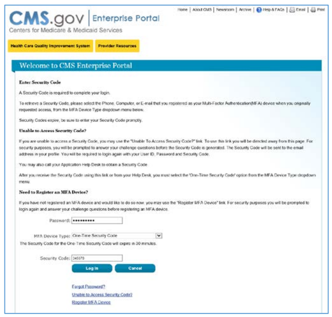
Figure 11: Enter Password, Select One-Time Security Code, and Enter Security Code