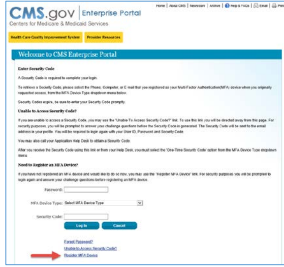
Figure 2: Register MFA Device Link