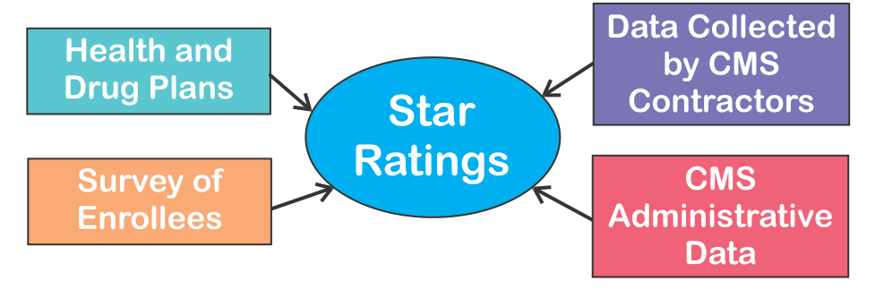
Figure 2: The Four Categories of Data Sources

For a health and/or drug plan to be included in the Part C & D Star Ratings, they must have an active contract with CMS to provide health and/or drug services to Medicare beneficiaries. All of the data used to rate the plans are collected through normal contractual requirements or directly from CMS systems. Information about Medicare Advantage contracting can be found at: <a href="https://www.cms.gov/Medicare/Medicare-AdvantageApps/index.html">https://www.cms.gov/Medicare/Medicare-AdvantageApps/index.html</a> and Prescription Drug Coverage contracting at: <a href="https://www.cms.gov/Medicare/Prescription-Drug-coverage/PrescriptionDrugCovContra/index.html">https://www.cms.gov/Medicare/Prescription-Drug-coverage/PrescriptionDrugCovContra/index.html</a>. The data used in the Star Ratings come from four categories of data sources which are shown in Figure 2.