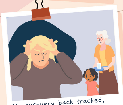
My recovery back tracked, but I picked myself up and continued my journey.