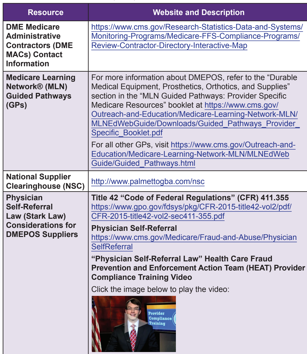
Table 1. DMEPOS Resources (cont.)