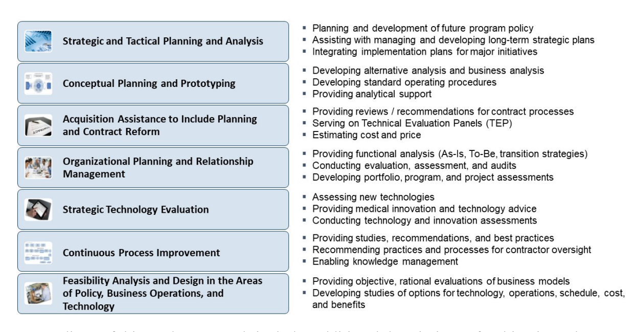
Figure 2. Seven Task Areas for Health FFRDC Work

Appendix B of this Ordering Guide includes additional descriptions of tasking in each area.