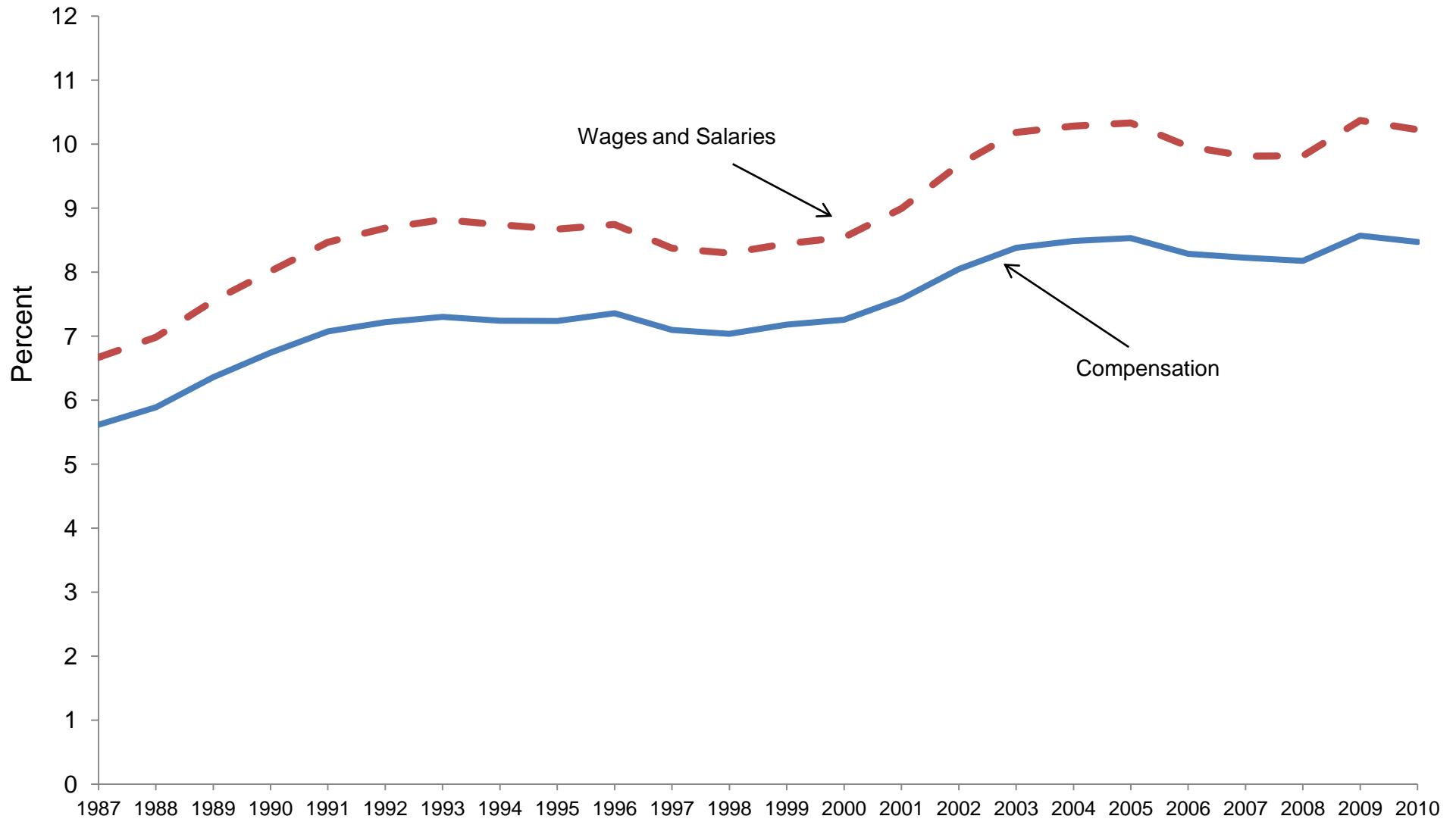
Figure 1 Business Health Spending as a Percent of Compensation, and Wages and Salaries: Calendar Years 1987 -2010

Sources: Centers for Medicare & Medicaid Services, Office of the Actuary: Data from the National Health Statistics Group, 1987-2010; U.S. Department of Commerce, Bureau of Economic Analysis, September 2011