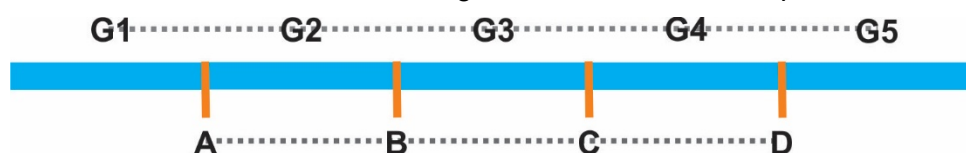
Figure J-1: Diagram showing gaps in data where cut points are assigned

For Star Ratings, the algorithm is run with the goal of determining the four cut points (labeled in the Figure J-1 below as A, B, C, and D) that are used to create the five non-overlapping groups that correspond to each of the Star Ratings (labeled in the diagram below as G1, G2, G3, G4, and G5). For Part D measures, CMS determines MA-PD and PDP cut points separately. Data identified to be biased, erroneous, or excluded by disaster rules are removed from the algorithm. The scores are grouped such that scores within the same Star Rating category are as similar as possible, and scores in different categories are as different as possible.