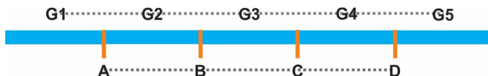
Figure K-1: Diagram showing gaps in data where cut points are assigned.

As mentioned, the cut points are used to create five non-overlapping groups. The value of the lower bound for each group is included in the category, while the value of the upper bound is not included in the category. CMS does not require the same number of observations (contracts) within each group. The groups are identified such that within a group the measure scores must be similar to each other and between groups, the measure scores in one group are not similar to measure scores in another group. The groups are then used for the conversion of the measure scores to one of five Star Ratings categories. For most measures, a higher score is better, and thus, the group with the highest range of measure scores is converted to a rating of five stars. An example of a measure for which higher is better is Medication Adherence for Diabetes Medications . For some measures a lower score is better, and thus, the group with the lowest range of measure scores is converted to a rating of five stars. An example of a measure for which a lower score is better is Members Choosing to Leave the Plan .