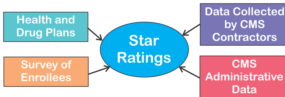
Figure 2: The Four Categories of Data Sources

For a health and/or drug plan to be included in the Part C & D Star Ratings, they must have an active contract with CMS to provide health and/or drug services to Medicare beneficiaries. All of the data used to rate the plans are collected through normal contractual requirements or directly from CMS systems. Information about Medicare Advantage contracting can be found at: https://www.cms.gov/Medicare/Medicare-Advantage/MedicareAdvantageApps/index.html and Prescription Drug Coverage contracting at: https://www.cms.gov/Medicare/Prescription-Drug-coverage/PrescriptionDrugCovContra/index.html . The data used in the Star Ratings come from four categories of data sources which are shown in Figure 2.