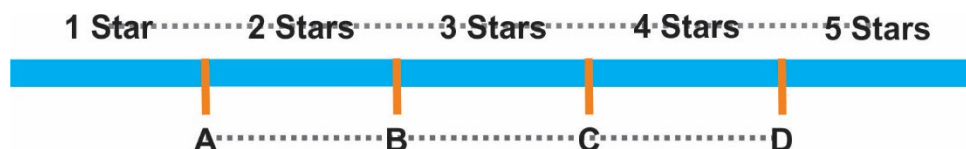
Figure K-3: Diagram showing star assignment based on cut points.