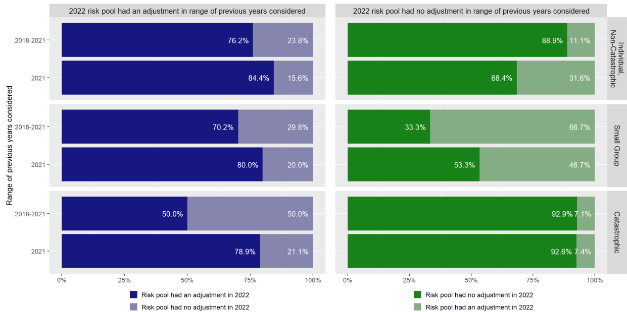
Figure 2: Likelihood of 2022 Benefit Year State Market Risk Pools having HHS-RADV Adjustments, by Adjustment Status in Previous Benefit Years 16,17

Figure 2 shows the likelihood of whether a state market risk pool has HHS-RADV adjustments in the 2022 benefit year based on whether the state market risk pool had an HHS-RADV adjustment in a previous benefit year of HHS-RADV. The left bar chart shows that in the individual non-catastrophic market risk pool, if there were HHS-RADV adjustments to state transfers for the state market risk pool in 2021, then there is an approximately 84 percent chance that the same state market risk pool will have HHS-RADV adjustments in the 2022 benefit year. When considering the presence of adjustments in the state market risk pool over multiple prior years of HHS-RADV, the relationship between the presence of prior adjustments and adjustments in the 2022 benefit year remains strong but is slightly weaker than the relationship between the presence of a 2021 benefit year HHS-RADV adjustment and HHS-RADV adjustments in the 2022 benefit year. Specifically, if the state market risk pool had HHS-RADV adjustments in at least one year between 2018 and 2021, the chance that it will have HHS-RADV adjustments in the 2022 benefit year is approximately 76 percent. This pattern remains consistent across state market risk pools, indicating that having a recent HHS-RADV adjustment in a state market risk pool is likely a fair predictor of having HHS-RADV adjustments for future benefit years in that state market risk pool.