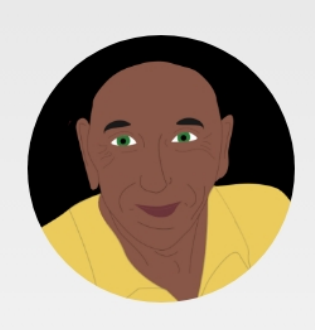
Exhibit 3. Fictitious user persona for low-touch beneficiary