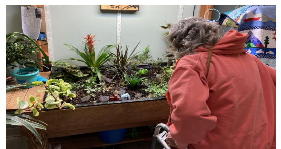
A resident at McKay Healthcare & Rehabilitation Center in Soap Lake, Washington spending time observing the garden.

Funded Entity: LeadingAge Washington in Partnership with Eldergrow