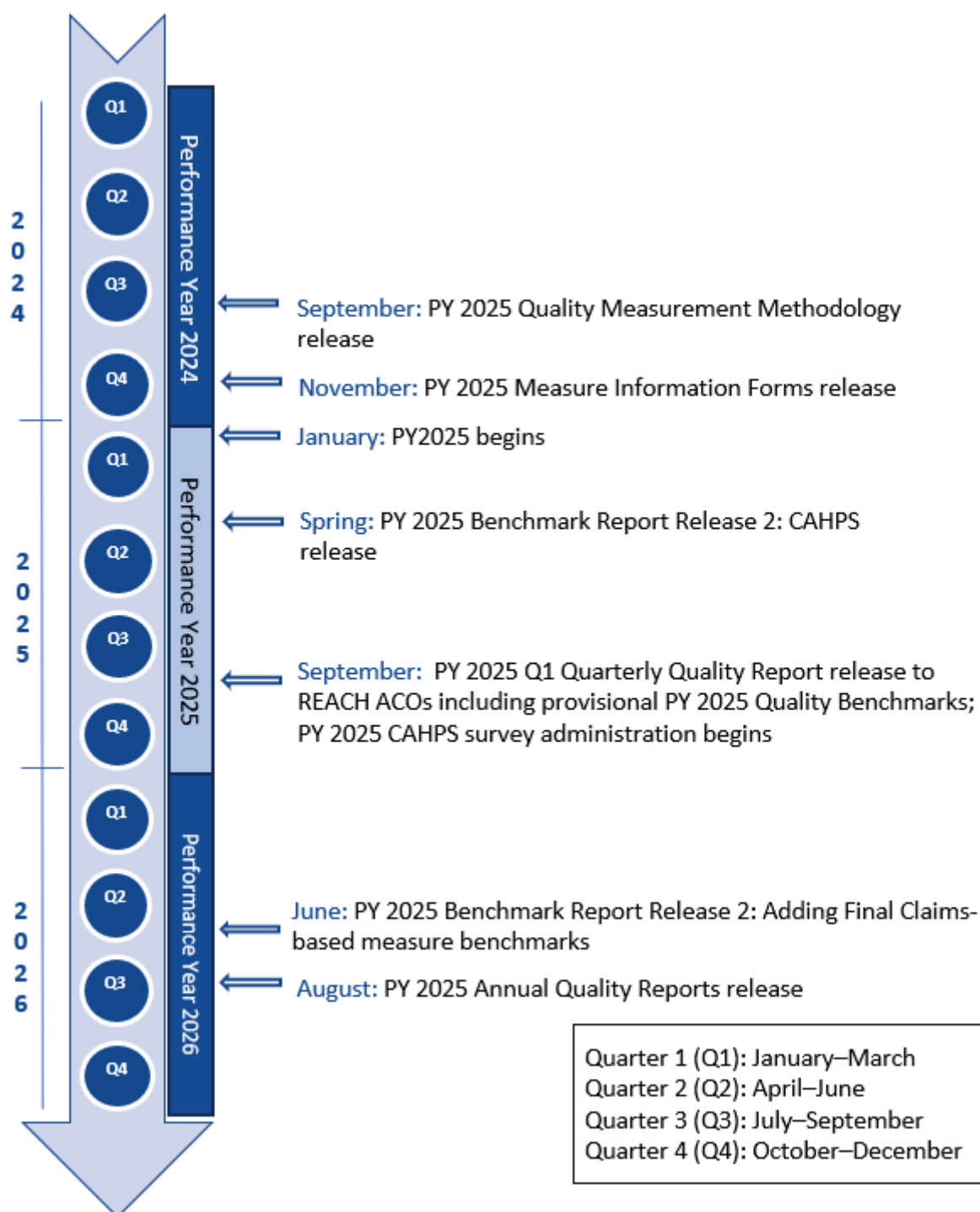
Figure A.2. Timeline of Quality Reporting and Performance Assessment Activities for PY 2025

CAHPS = Consumer Assessment of Healthcare Providers and Systems; PY = Performance year