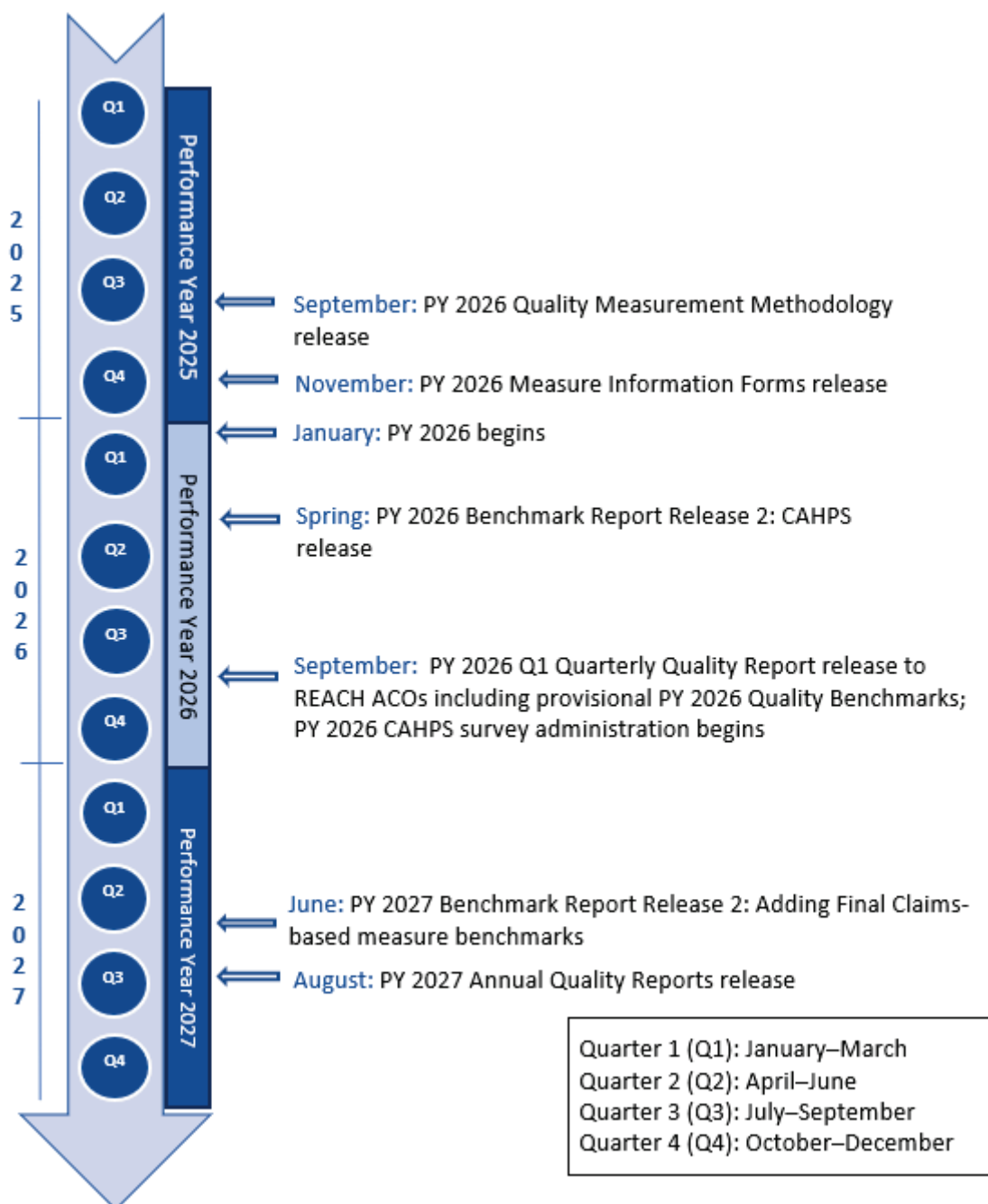
Figure A.1. Timeline of Quality Reporting and Performance Assessment Activities for PY 2026

CAHPS = Consumer Assessment of Healthcare Providers and Systems; PY = Performance year