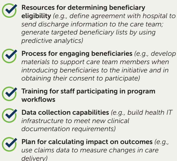
Figure 2. Elements from an ACO Readiness Checklist for Initiative Expansion

Outcome measures help an ACO to determine whether the initiative meets its objectives and its overall strategic goals; these measures also help ACO executives decide whether to sustain or expand the initiative. ACOs carefully design their analyses to account for factors that might make ordinary fluctuations in outcomes appear to be attributable to the initiative. ACOs also consider whether the sample in pilot tests is large enough to adequately measure changes in outcomes. In addition, they consider the fact it may be months or years before they can determine an initiative's impact on beneficiaries' care patterns. Taking these challenges and limitations into account helps ACOs to make a more informed assessment of the extent of their initiative's impact and whether further investments are warranted.