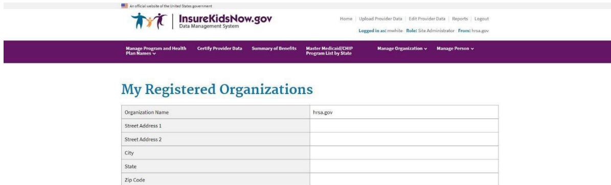
Figure 8: My Registered Organizations

All users have the option to view the organizations they are registered under by selecting 'My Registered Organizations' option in the navigation bar on the IKN Data Management website home page. The 'My Registered Organizations' page is depicted in Figure 8.