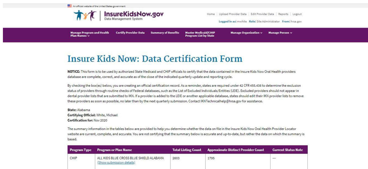
Figure 14: Certify Provider Data Feature

State Administrators can use the 'Certify Provider Data' feature to certify that the data submitted for their state is accurate and up to date. This feature is accessed by selecting the 'Certify Provider Data' menu option from the navigation bar on the IKN Data Management website Home Page. Figure 14 pictures the 'Certify Provider Data' feature.